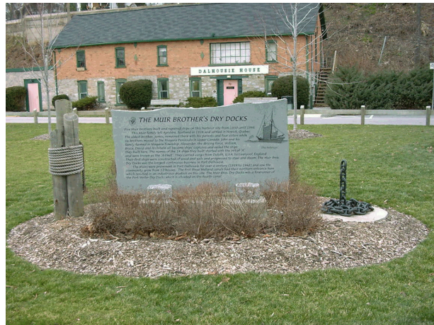
The Muir Brothers Dry Dock installation in Rennie Park