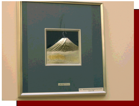
Relief of Mount Fuji Takehiko at City Hall